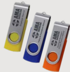
ONE YEAR FREE AWARD SUBSCRIPTION SERVICE WHEN PURCHASING ALL THREE WORKPLACE RELATIONS MANUALS