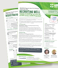
DISCOUNT ON WORKPLACE RELATIONS TRAINING